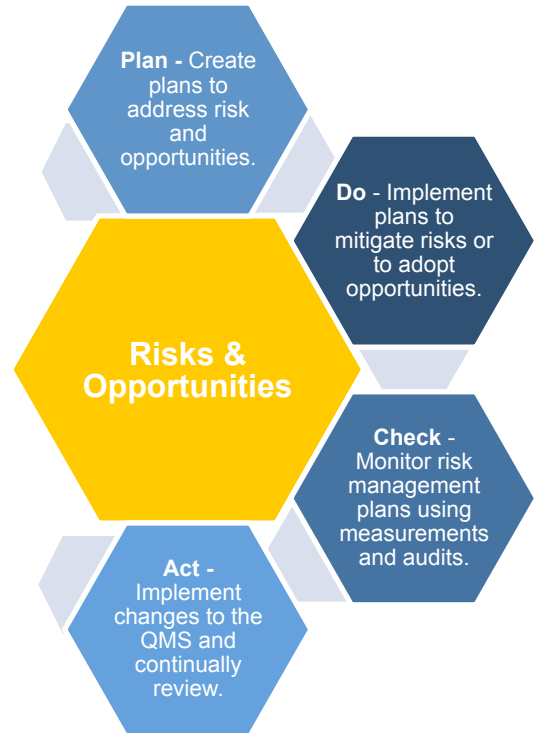
Risk & Opportunities PDCA Cycle

A & S Integrated Services Ltd has classified its 'risk appetite' as the amount of risk that we are willing to accept in pursuit of an opportunity or the avoidance of risk where each pertains to product and/or system conformity, and which reflect the following considerations: